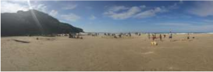
Chintsa Beach was filled with folk making sand castles.