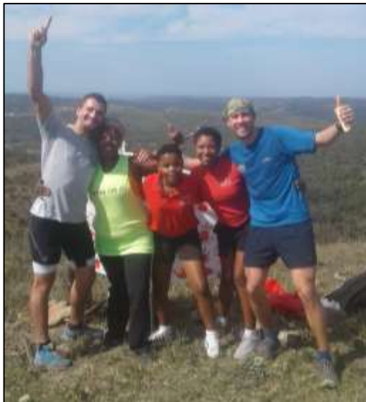
The African Angels Selfie spot at the top of the Chefani River was as popular as ever.