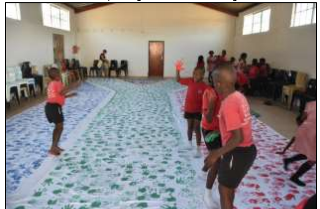
The huge flag created by learners and the Mercedes Benz South Africa team.

Mandela Day 2018 saw a huge team from Mercedes Benz South Africa arrive at African Angels. The MBSA team helped with the round robin of games that each class was participating in, and were instrumental in the creation of a hall sized, hand painted, South African flag. We would like to thank every MBSA team member who came and gave up their day to spend with our children.