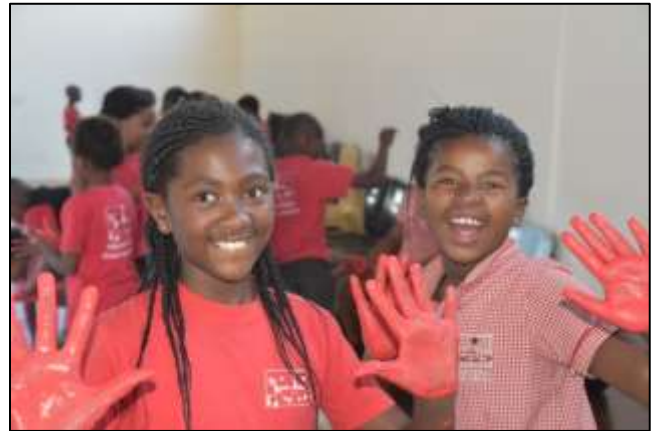
Hand painting the South African flag.