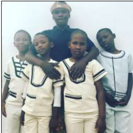
African Angels – growing good men

The learners were invited to participate in Heritage Day at school this year and come in traditional outfits. We want our learners to be proud of their Xhosa heritage and take this day to celebrate it.