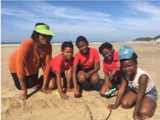
Parents came down to build sand castles with their children.