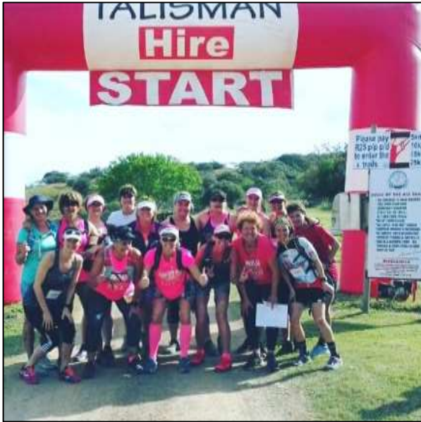
African Angels Ale Trail sponsored by Talisman Hire East London